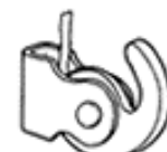
HH80 80kg (for use with heavy Duty hangers)